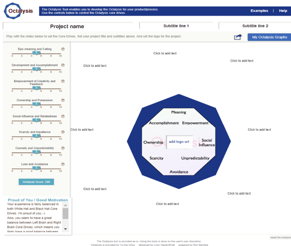
Figure 1. The Octalysis Tool [35].

The integration of two different models in this second stage of qualitative content analysis relies on the need for 1) adding theoretical triangulation in exploratory studies and 2) integrating the strengths of each model. Both models follow the same goal; however, while the first focuses mostly on gamification as the tool, the second one focuses on climate-change-related issues as the main topic.