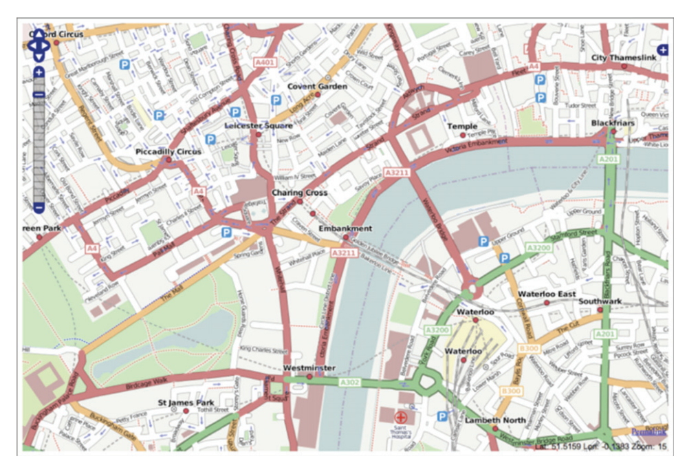
Figure 2. OpenStreetMap coverage of Central London, produced largely by the efforts of volunteers.

of what can be achieved by NeoGeographers in an arena previously dominated by large, expensive central mapping agencies such as the Ordnance Survey of Great Britain.