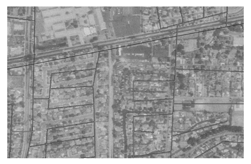
Figure 4. Misregistration of digital orthoimagery and roads in the US Geological Survey's National Map service.

little understanding of the details of the production process and little interest in the published metadata. Instead data are taken at face value, particularly when they concern phenomena that are part of everyday experience. Nevertheless one way to establish authority would be for novel sources such as OpenStreetMap to publish extensive documentation of the procedures used and to initiate programs of quality testing.