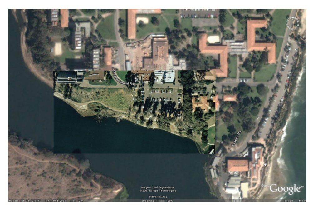
Figure 3. Google Earth mashup of a high-resolution image of part of the campus of the University of California, Santa Barbara, illustrating the inferred misregistration of the Google Earth base imagery.

Google base that is most substantially misregistered. However, a 15m shift is quite acceptable for many of the purposes for which Google Earth was designed.