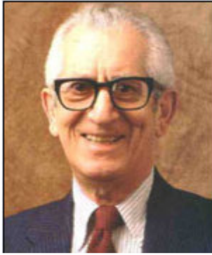
Caption: Photograph of Benjamin Bloom'

Benjamin Samuel Bloom, one of the greatest minds to influence the field of education, was born on February 21, 1913 in Lansford, Pennsylvania. As a young man, he was already an avid reader and curious researcher. Bloom received both a bachelor's and master's degree from Pennsylvania State University in 1935. He went on to earn a doctorate's degree from the University of Chicago in 1942, where he acted as first a staff member of the Board of Examinations (1940-43), then a University Examiner (1943-59), as well as an instructor in the Department of Education, beginning in 1944. In 1970, Bloom was honored with becoming a Charles H. Swift Distinguished Professor at the University of Chicago.